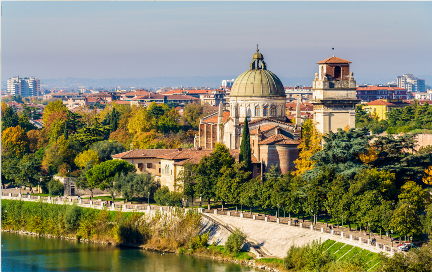
San Giorgio in Braida

Dating back to the 9th century, although the current structure is largely the result of a reconstruction in the 16th-century Renaissance style. Inside San Giorgio in Braida, there is a distinctive floor with a spiral-shaped labyrinth, the 'Labyrinth of Juliet,' and it is considered a symbol of eternal love. You can follow the path of the labyrinth to the center and celebrate your love!